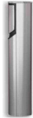
EVC100 Ground mounting